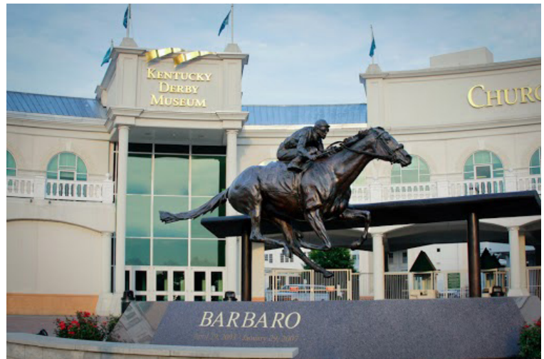
Kentucky Derby Museum