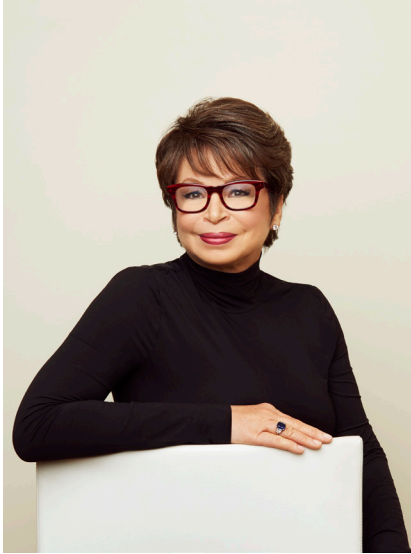
Valerie Jarrett Former Presidential Adviser