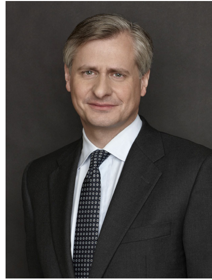
Jon Meacham Best-Selling Author