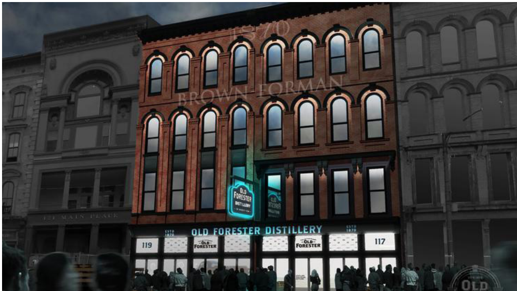
Old Forester Distillery