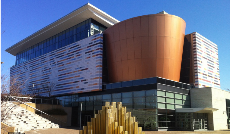
Muhammad Ali Center